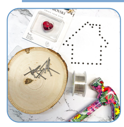
STEP 1 Print nail template (see next page for template) outline to the desired size.